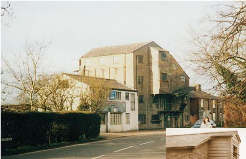
These two photos show 'Home Mill', Elmswell.