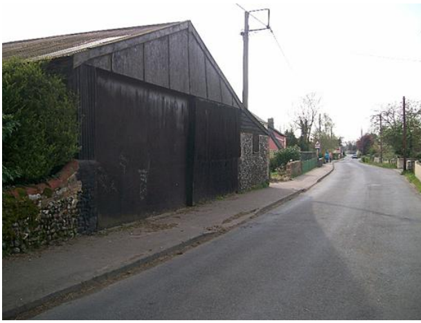
Downing's barn, The Street. Now cottages shown below.