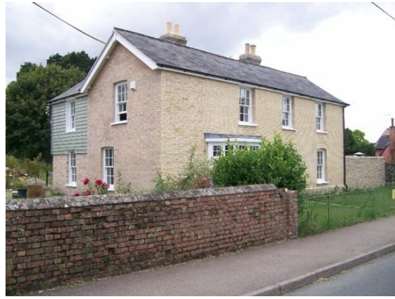
Mill Farm House.