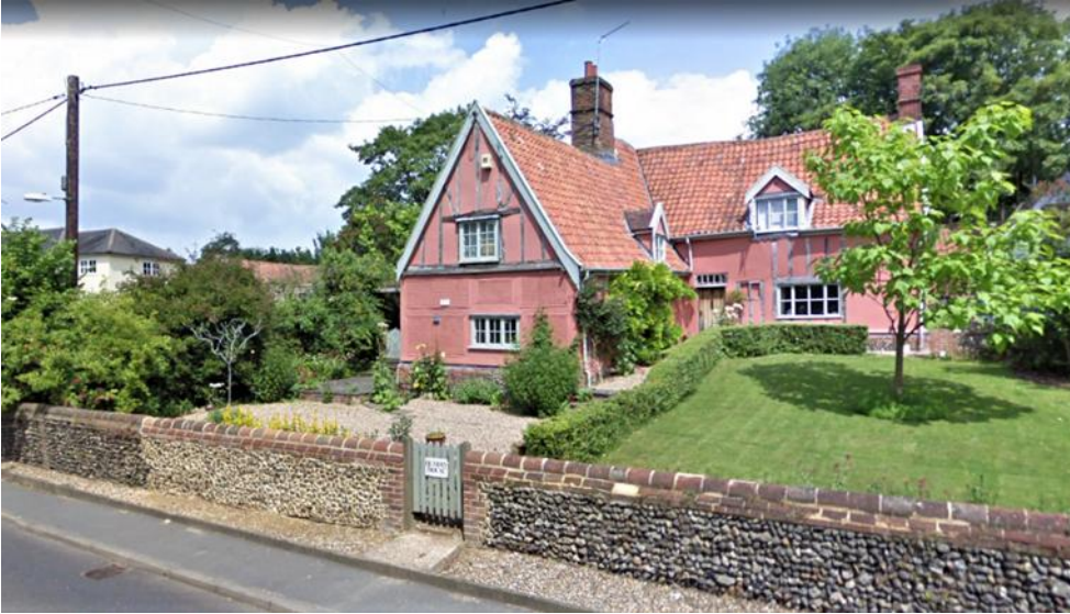
Quarry House, Stanton Street.