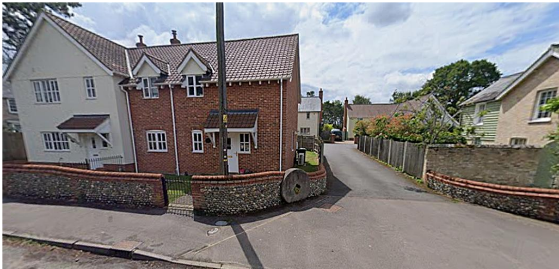
Present day view of what was the farmyard with Mill Farm House on right.