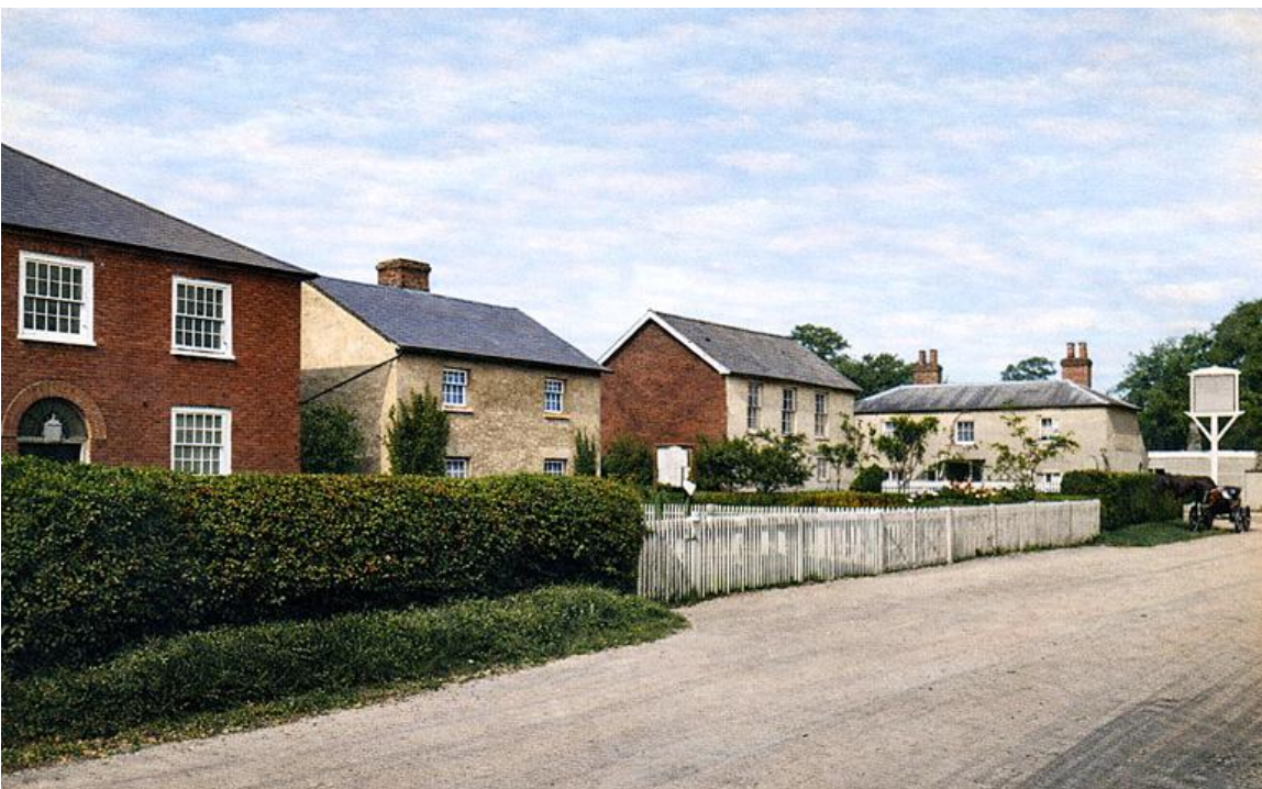
14) From the Baptist Chapel to the original Plumber's Arms. (The old pub was 'edge on' to the road. The original Plumber's Arms and the village meeting room this side of it, were both demolished in the late 1950s, to make room for the new Plumber's Arms.)