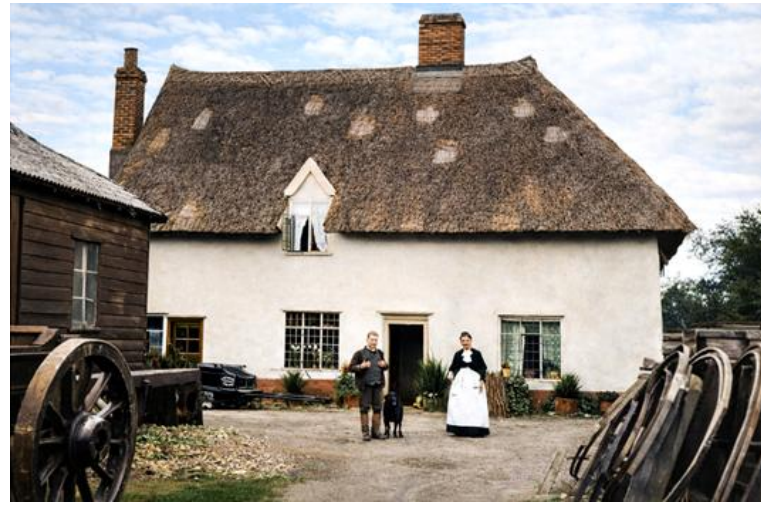
7) Traction engine turning in to the Old Forge yard. 8) The Old Forge about 1890