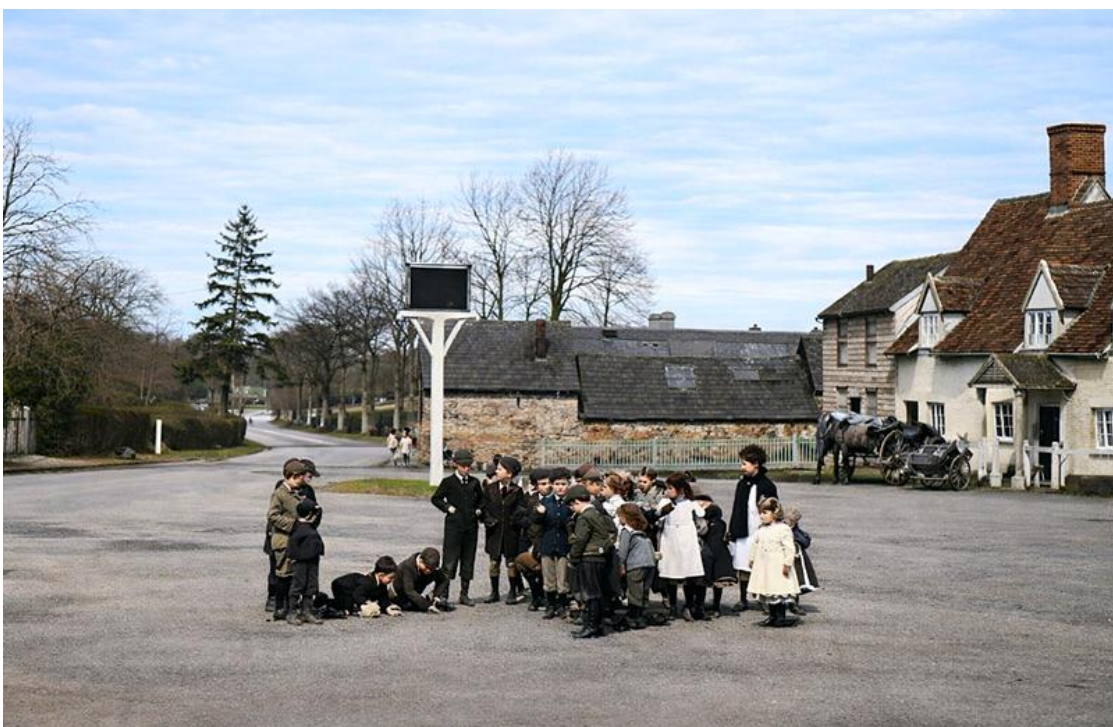
10) Children playing marbles at The Dog. Pre WW1