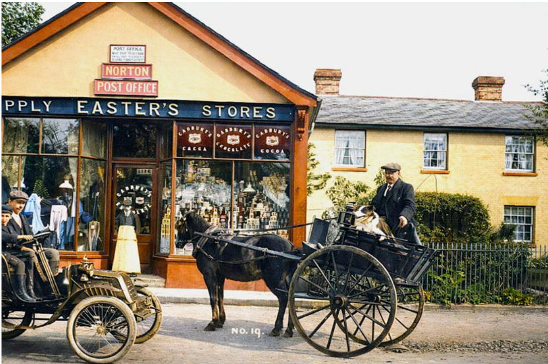
9) Edward Easter's Post Office and store. 1905.