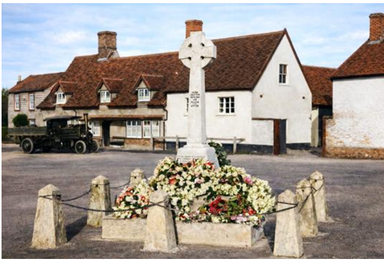
11) New War Memorial & Steam Lorry.