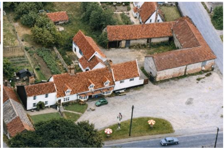
12) Aerial view of 'The Dog' and Maltings.