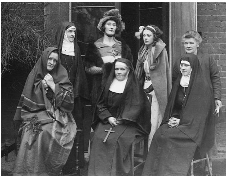
Photo 3. The play was called 'Sanctuary'.