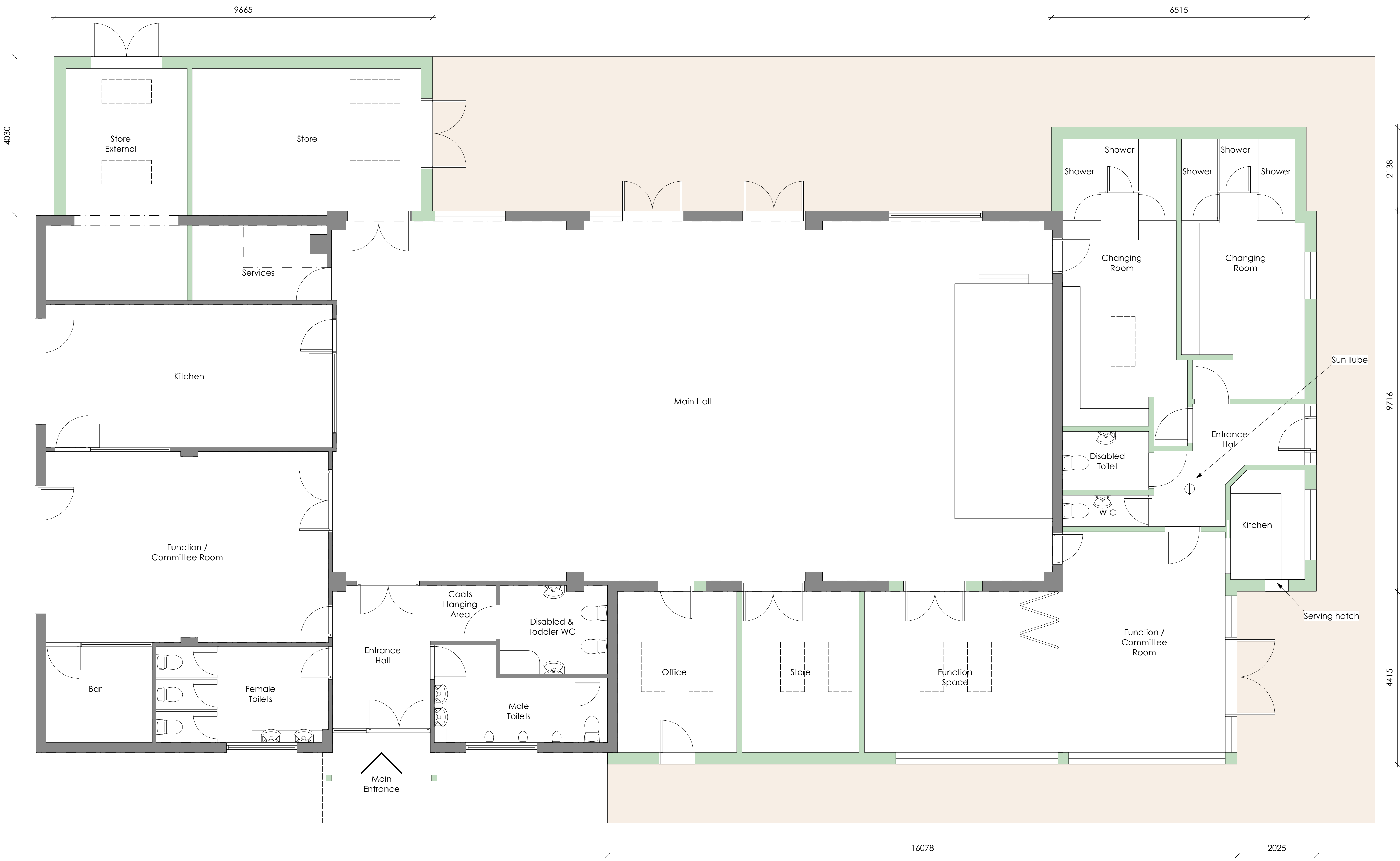
FLOOR PLAN 1:50