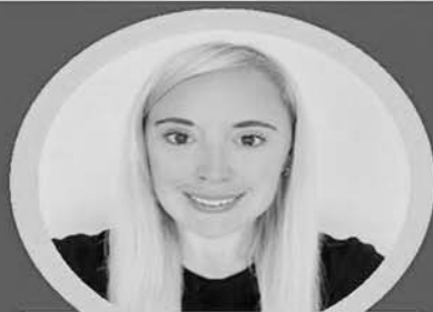
Our Head Teacher