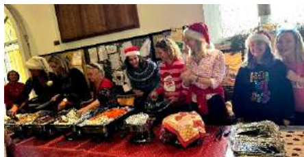
The catering team

On 11 December, a miracle occurred in our church. An amazing three course lunch for approximately sixty people appeared for us oldies without an oven in sight. It was such a joy to see all our long standing friends and to sit down and eat a very tasty Christmas dinner, with the children from All Saints' school serving us so expertly. I don't know how they managed it, but we did so enjoy it. Talking to the children on our table was so interesting, finding out about them, their likes and dislikes, their families, where they lived etc.