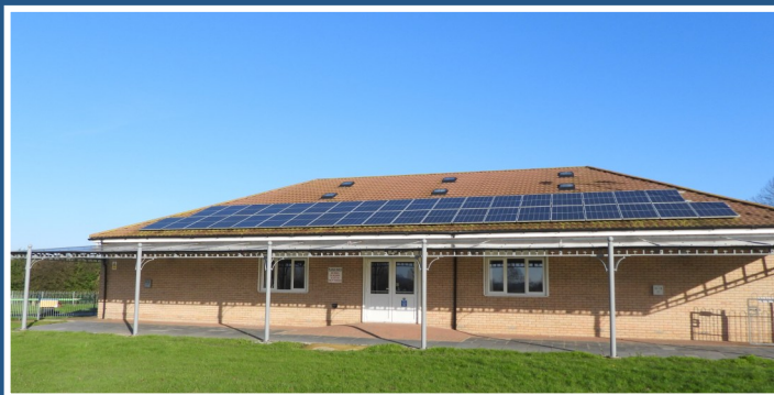
Solar Panels and Veranda