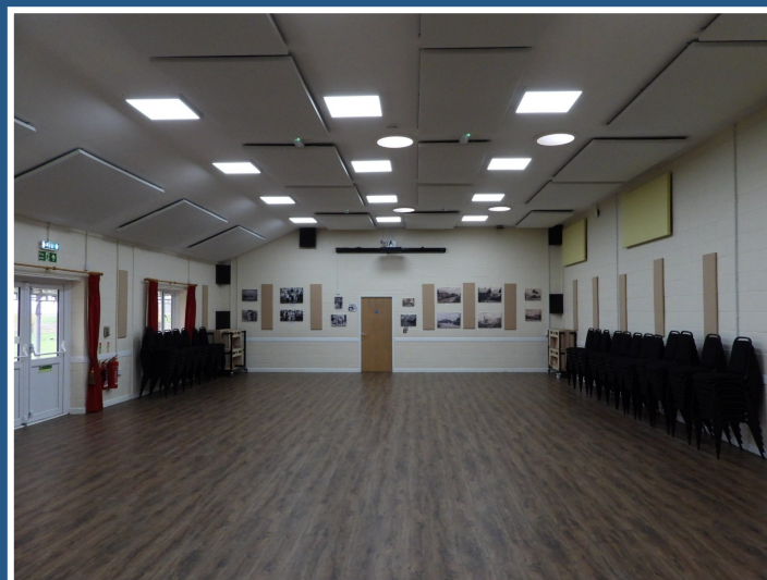
Wall and Ceiling Acoustic Panels

WHAT3WORDS REFERENCE: https://w3w.co/munch.cone.advice